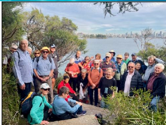
Thirty-four walkers attended the May Hermitage Walk to Nielsen Park, with some continuing to Watsons Bay. Short and Long Groups paused after Milk Bay at a lookout sampling the sights of Sydney Harbour with city skyscrapers in the background. Straggler and Strollers enjoyed a social outing in Nielsens Park. There were three groups on this outing. The Straggler and Strollers group are not in the picture.

Variations to Public Risk Insurance has led to bush walks