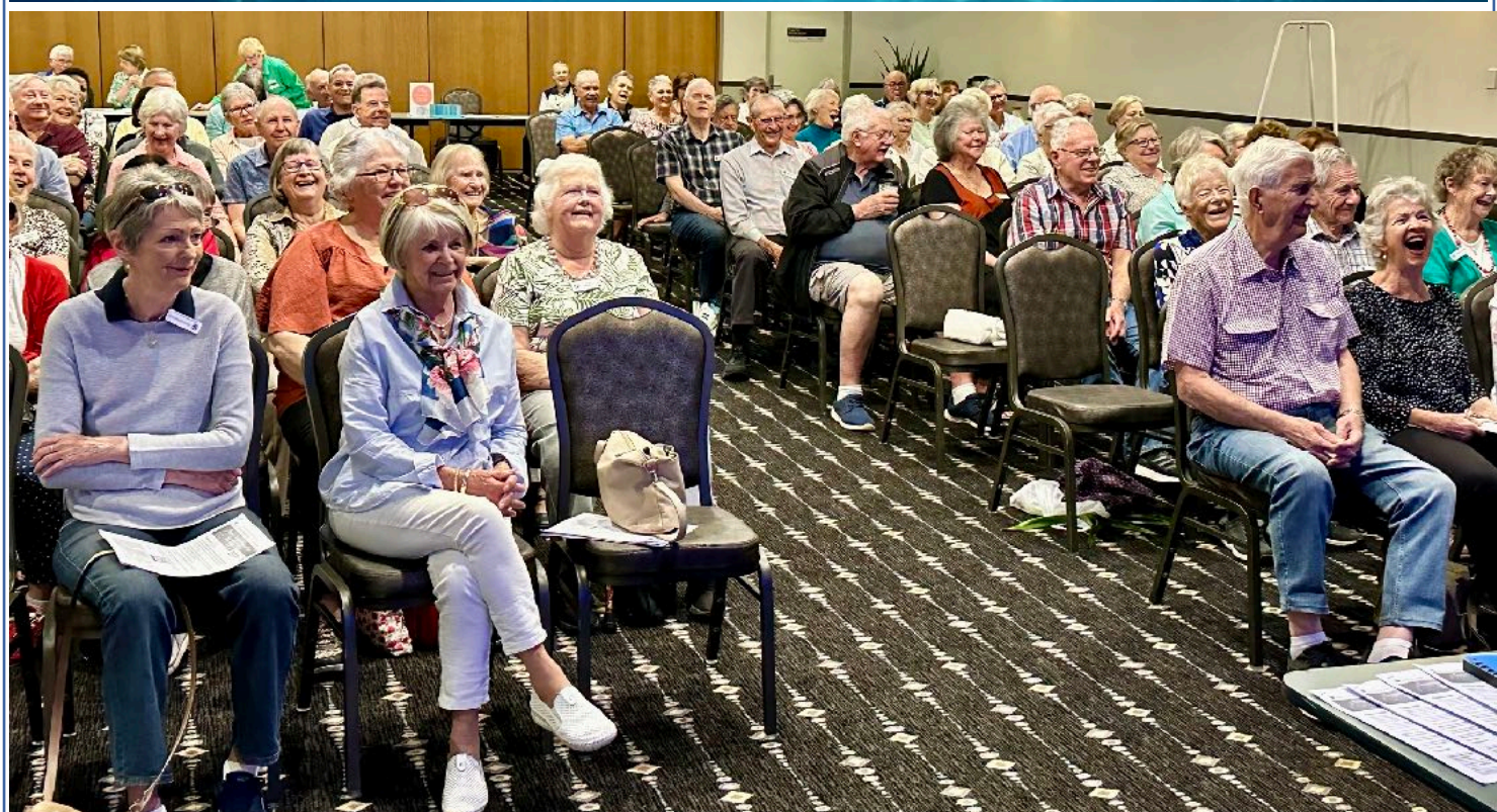
AMPC meeting at Magpies Waitara in November 2023