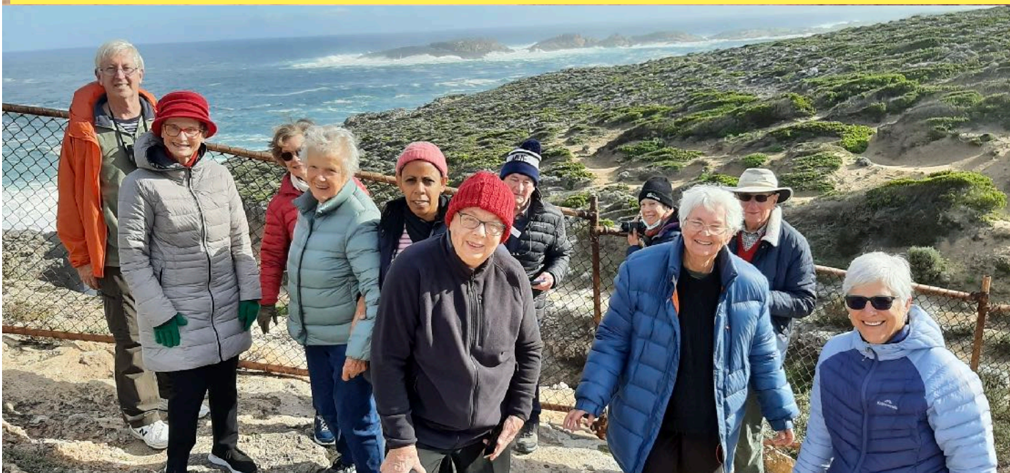
Braving the blustery winds at the most southerly end of Eyre Peninsula at Whalers Bay. The wind comes directly from Antarctica just behind the group.